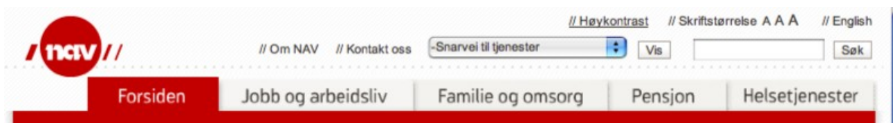
Figur 6: nav.no

In a great number of domains a consensus has emerged on the design of “everyday things” [4]. Cars, airports, banking services, houses, etc. are designed according to certain design patterns [5] in a way that give people the possibility to find their way around, without preventing the design of new and unexpected solutions. Better procedural accessibility of Web resources will eventually emerge. To ensure access for all citizens, this process has to be speeded up.