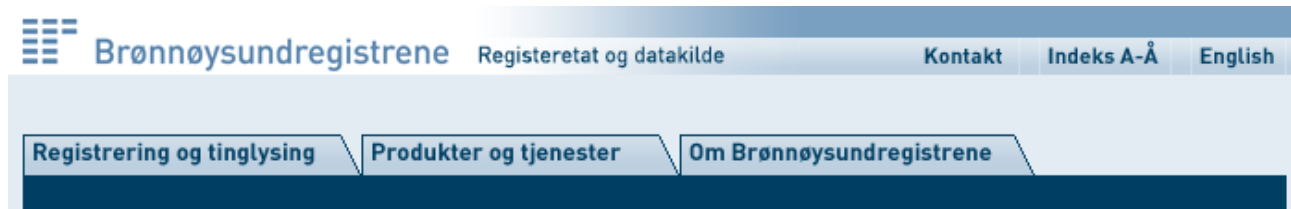
Figur 2: brreg.no