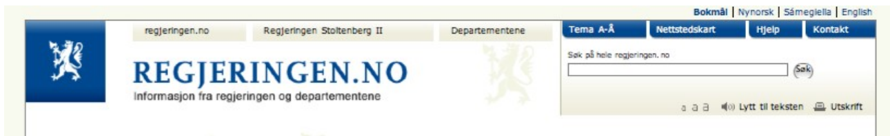
Figur 1: regjeringen.no