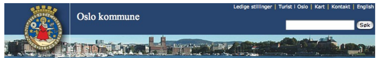
Figur 4. oslo.kommune.no